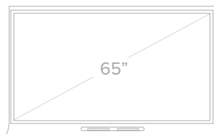
SMART Board 6065