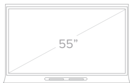
SMART Board 6055

Writing is natural and looks better with SMART ink. Whether you're using a pen or finger, each stroke is a work of art. Its realistic digital ink improves legibility, so teachers don't have to re-write and students feel confident contributing.